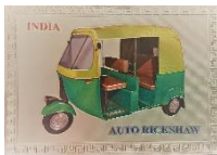
$100- Magnet or Ornament