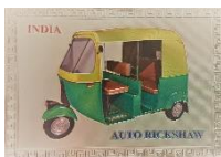
$100- Magnet or Ornament