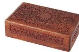
$1,000- Carved Wooden Box

Donation forms and donations collected need to be turned in on Saturday, November 6, at the registration table between 8:00am-9:15am.