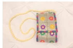
$250- Purse or Puzzle