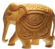
$500- Carved Wooden Elephant